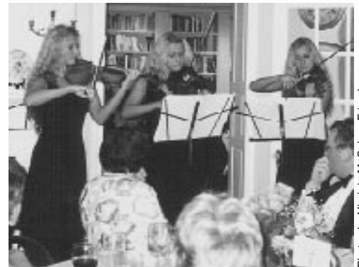
The Okapiiec trio from Poland