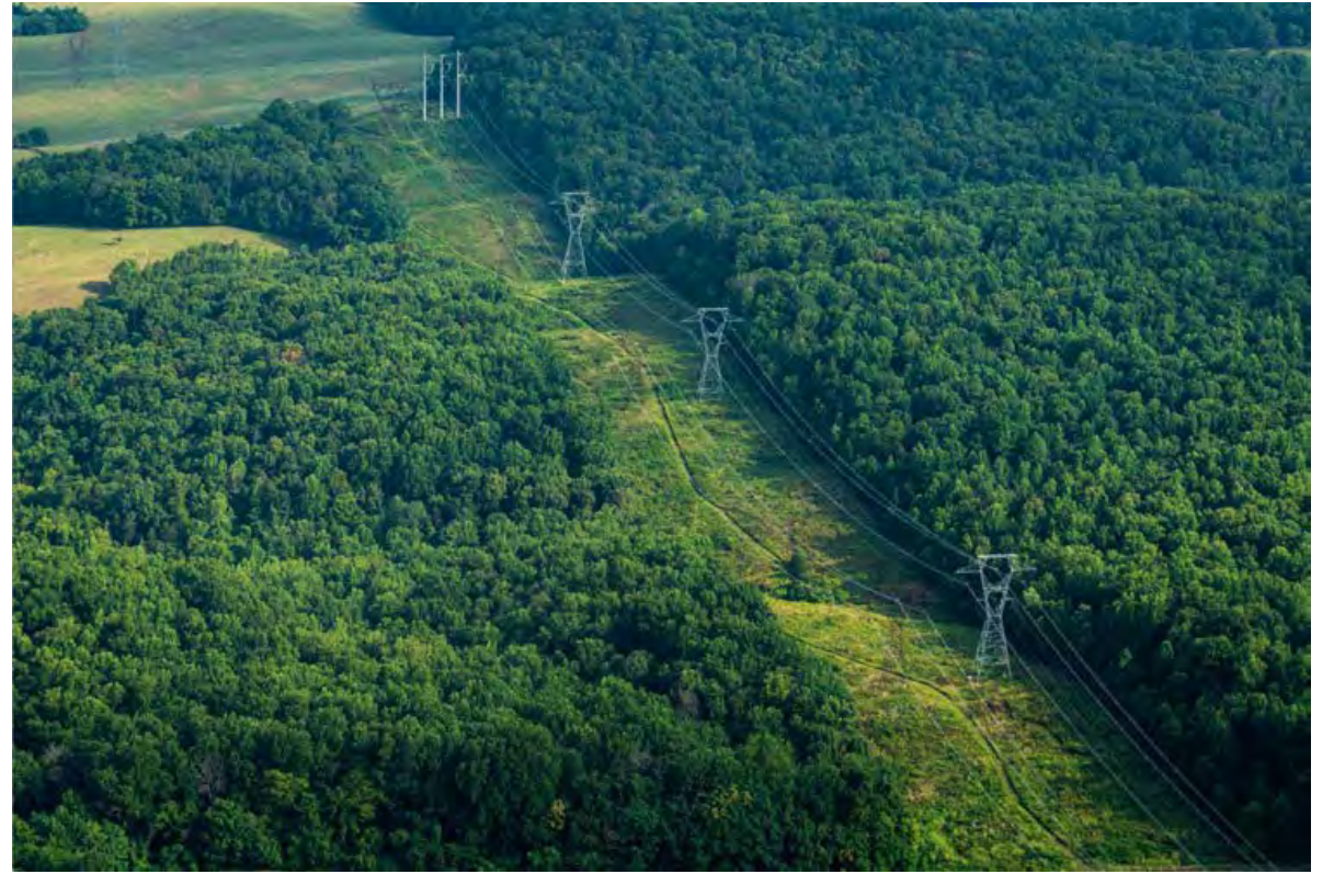
500 kV Lines